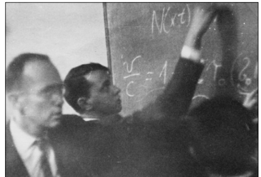
Letokhov (back) explains to Townes (front) the phenomenon of superluminal laser pulse propagation in a saturated active medium during his 1965 visit to FIAN.

cow State University. At this time Basov was insistently developing the concept of a semiconductor laser, and he accepted me to work in a research group engaged on this problem. It happened that I was immediately drafted for a three-month course of military training for officers. Physics students were educated in radar systems at the Military Chair. We studied, in particular, an analogue of the SCR-534 American radar, which was supplied to our country during World War II under the lend-lease programme. Knowledge of radars proved to be very useful for me, an optics specialist, because the most important methods of lasing, such as Q-switching and mode-locking, were developed to a great extent under the influence of radar principles, and the chirped-pulse amplification method has a direct analogue in radar technology.