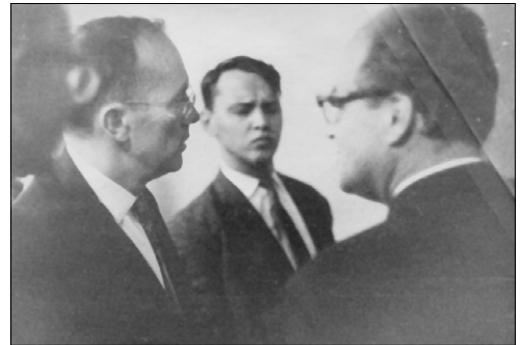
Charles Townes (left) visiting FIAN in 1965, with then-graduate-student Letokhov (centre) and Basov (right).

I joined FIAN early in the summer of 1961 after graduating from the Chair of Optics at the Department of Physics at Lomonosov Mos-