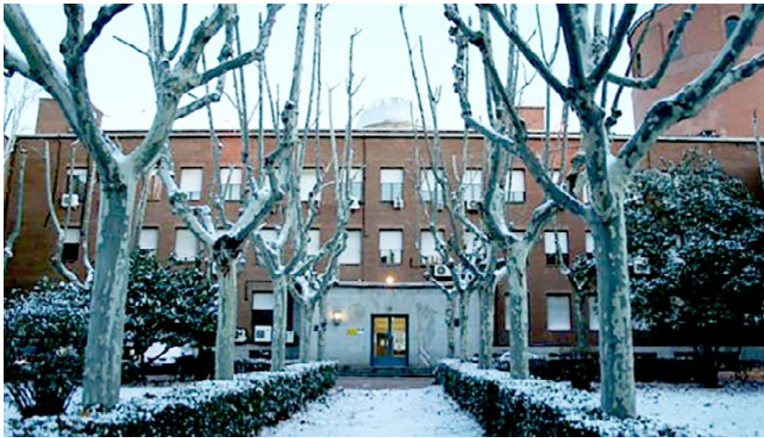
Institute of Optics "Daza de Valdés", former headquarter of SEDOPTICA

This 50th anniversary arrives in a moment of expansion of the optics and photonics community.