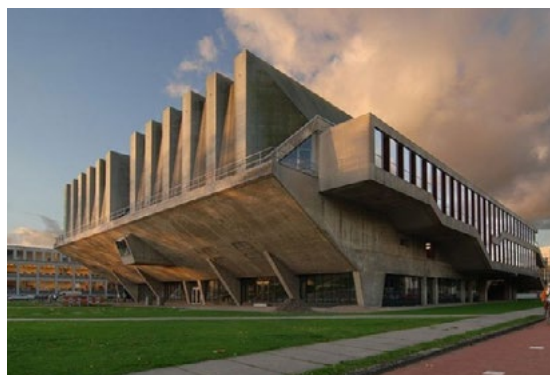
TU Delft Aula Congress Centre

Topical meetings (TOMS) in EOSAM 2018 include: