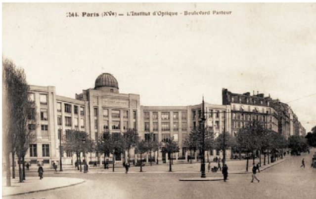
An early photograph of the first building dedicated to Institut d'Optique (inaugurated in 1927).

On 30th October 1917, "Institut d'Optique théorique et appliquée" registered as the combination of a school, a technical innovation center and research institution.