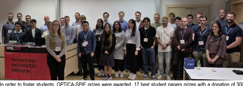
In order to foster students, OPTICA-SPIE prizes were awarded. 17 best student papers prizes with a donation of 300 Euro each were supported by OPTICA, SPIE and TU Dresden. They were presented by Michal Lipson, President Elect of OPTICA and Kent Rochford, CEO of SPIE. The DGaO awarded 3 prizes for the best posters during the closing session of the General Congress. Furthermore, the OPTICA-SPIE student chapter Dresden has invited for an evening seminar.